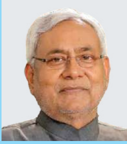
Shri Nitish Kumar Chief Minister, Bihar