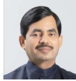
Shri Syed Shahnawaz Hussain Industries Minister, Govt. of Bihar